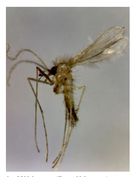
\begin{tabular}{ll} Fig. 3 & A male of $Phlebotomus$ (Transphlebotomus$) mascittii $captured in Rohrau, Lower Austria (Orig.) \end{tabular}

by combining their dispersal abilities with climatic prospects, projected sandfly establishment of species with current southeastern focus (P. neglectus, P. perfiliewi) in eastern Austrian regions neighbouring Slovenia and Hungary in the near future (Fischer et al. 2011). In that study it was further projected that P. ariasi and P. mascittii would disperse to south-eastern parts of Austria and would be able to occur in eastern and northeastern parts at the end of the twenty-first century (Fischer et al. 2011). Thus, it appears surprising that in the present study (1) P. mascittii and not P. neglectus was found in Eastern Austria and that (2) P. mascittii has obviously already established also in the north-eastern parts of Austria. However, the cited projections were based on the assumption that Austria was free of sandflies, and sandflies would invade the country from neighbouring countries. Today, all records of sandflies in Central Europe, including Austria, are considered to represent remnants of warmer periods in Central Europe and not to be associated with a recent immigration due to climate change and