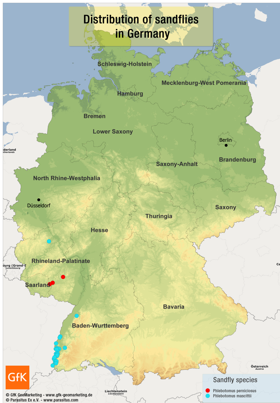
Figure 2 Known geographical distribution of sandflies in Germany. Various specimens of Phlebotomus mascittii were caught in different locations in Baden-Wuerttemberg and one specimen near Cochem on the Mosel river. In addition, Phlebotomus perniciosus was detected in Germany near Kaiserslautern (Rhineland-Palatinate) [2,17].

Cochem on the Mosel river. In addition, Phlebotomus ( P. ) perniciosus was detected near Kaiserslautern (Rhineland-Palatinate) [2,17] (Figure 2). Although P. mascittii has not yet been confirmed as a vector of leishmaniasis, its competence is suspected [2]. It is noteworthy that one specimen of P. perniciosus , the main vector of L. infantum , had been captured in Jersey, Channel Islands, United Kingdom [18]. However, intensive